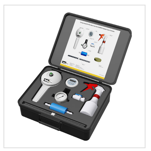
Storage and Carrying Case